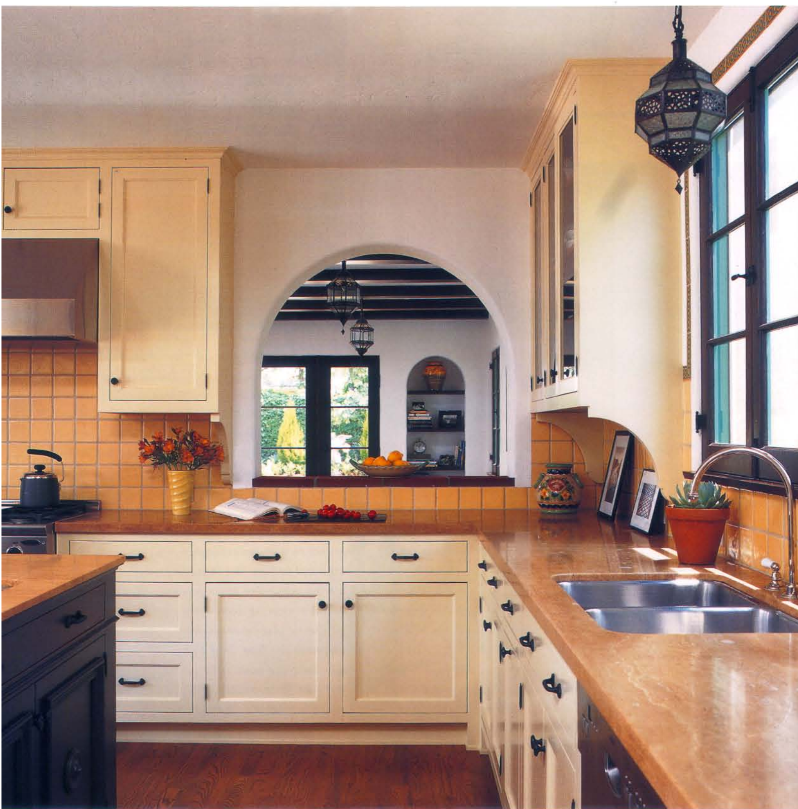
TOP: A sense of balance emanates from this original dining room niche and cabinet. It is just the right size for the room and serves as a guide for much of the new cabinetry. FACING PAGE: An arched opening connects the new kitchen with the family room and garden. Simple light cabinetry makes for a nice counterpoint to the richly hued, furniture-style island designed to match the dining room cabinet.