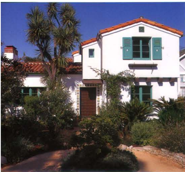
ABOVE: The low-pitched roof, restful symmetry, and restrained vocabulary make the original front facade warm and inviting. Tucked behind, the addition is barely perceptible. A corner of its roof can be seen behind the living room roof. RIGHT: A master bedroom reigns supreme on the second floor, enjoying materials and finishes other bedrooms do not. For a connection to the outdoors, the bedroom addition is to the rear and opens onto the backyard through an expanse of French doors out of public view.